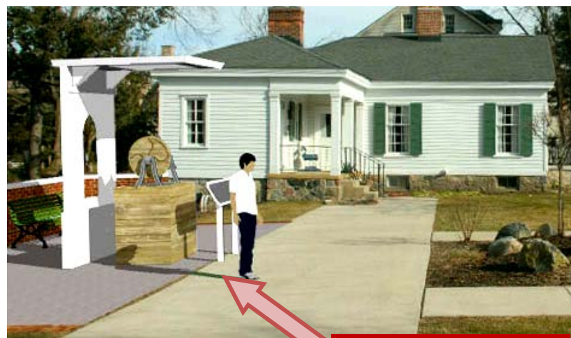
Pavers at ground level around bell structure.